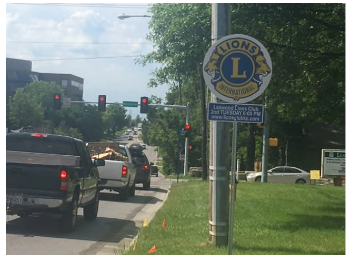
We're still proud of our new signs!!