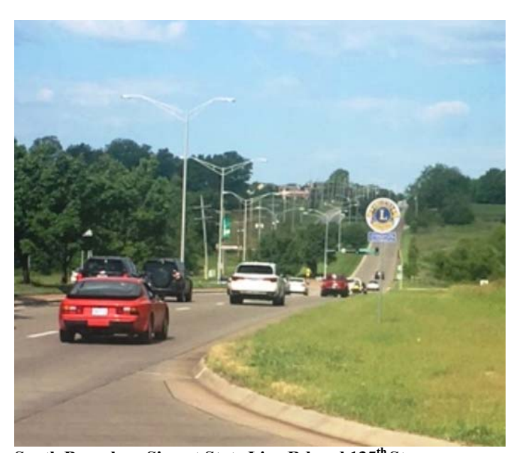
South Boundary Sign at State Line Rd and 135<sup>th</sup> St

2017-2018 Club Dues: Annual dues of $110 for individuals and $160 for families (member plus spouse) are due in June. Please pay your dues ASAP. Make your check payable to Leawood Lions Club and send it to: