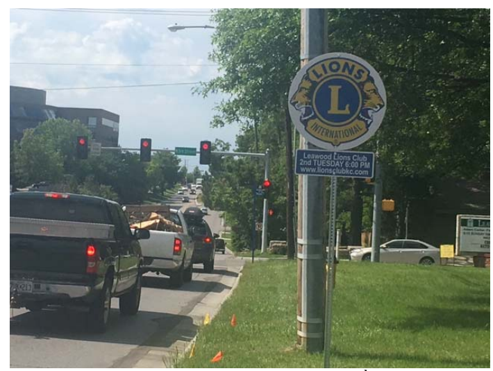
North Boundary Sign at State Line Rd and 83rd St

maintenance to ensure that this project follows the City of Leawood's regulations regarding traffic signs. Many thanks to the 2016-2017 Board Members who provided the funding for these signs