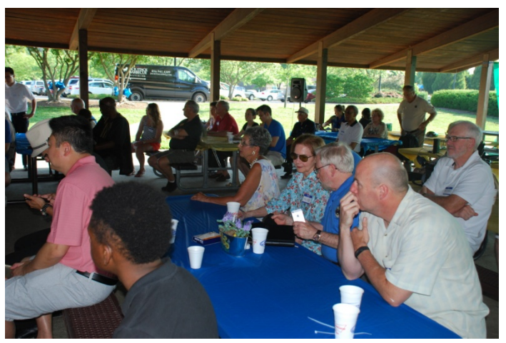
Over 60 Lions and guests attended the party.