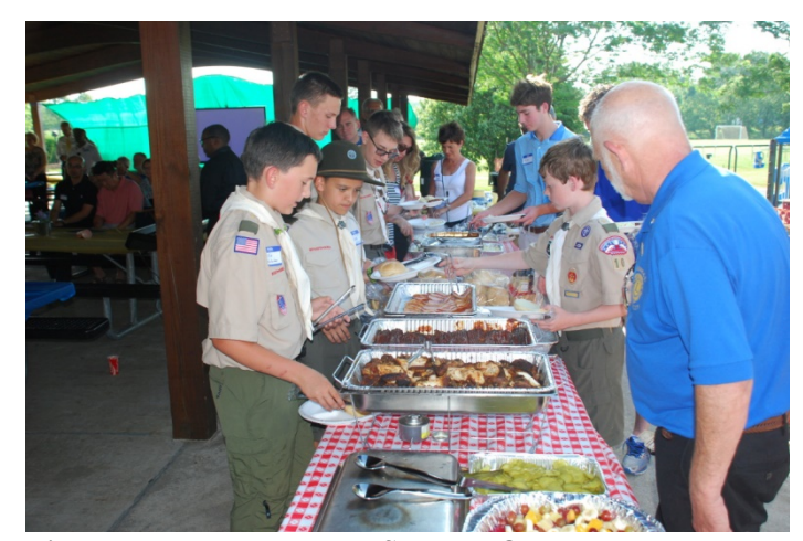
Dinner was catered by Jack Stack BBQ.