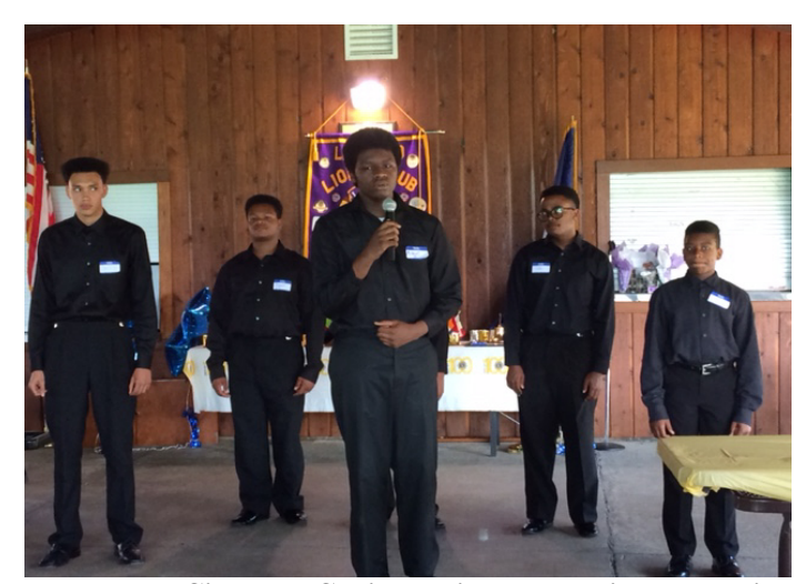
The Kansas City Boys Choir provided entertainment during dinner.