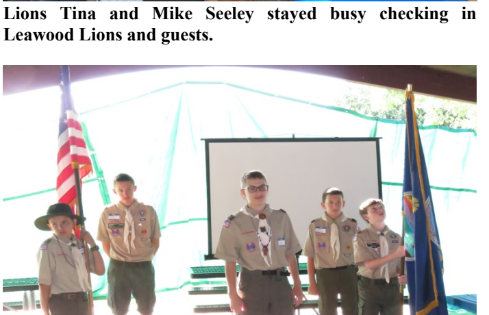
Boy Scout Troop 10 posted colors and led the Pledge of Allegiance.