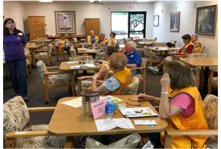
Mesa Sunland Springs hosted 5 trained pet, service, and therapy dogs from Paws 4 Life, located in Apache Junction.