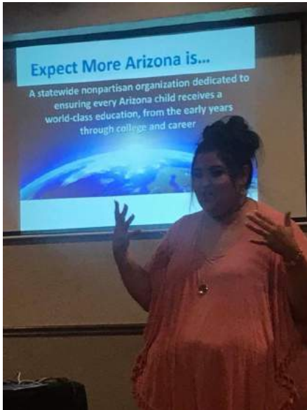
Expect More Arizona was guest of the Nogales LC.