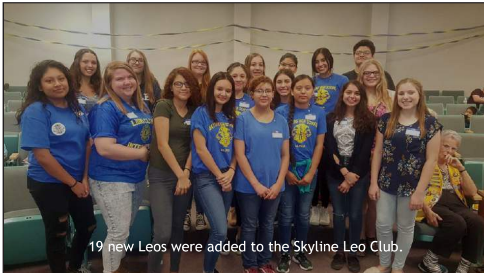
19 new Leos were added to the Skyline Leo Club.