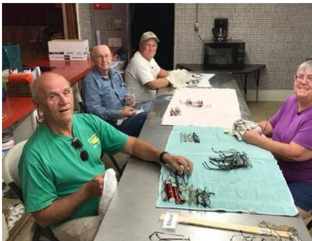
Globe Lions sort and clean eyeglasses for the Arizona Lions Eyeglass Recycling Terminal.