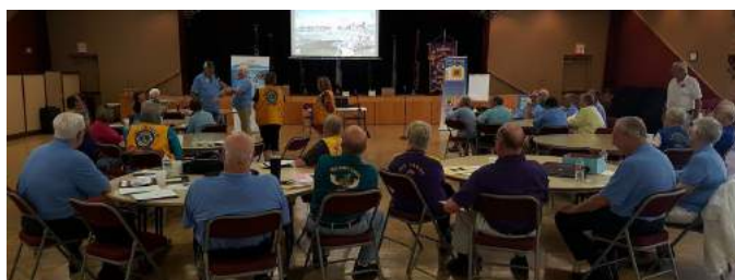
Lions listens attentively as a new member was inducted at the workshop.

The District Governor encourages ALL clubs to update their Facebook pages or create a Facebook page to promote your clubs!!