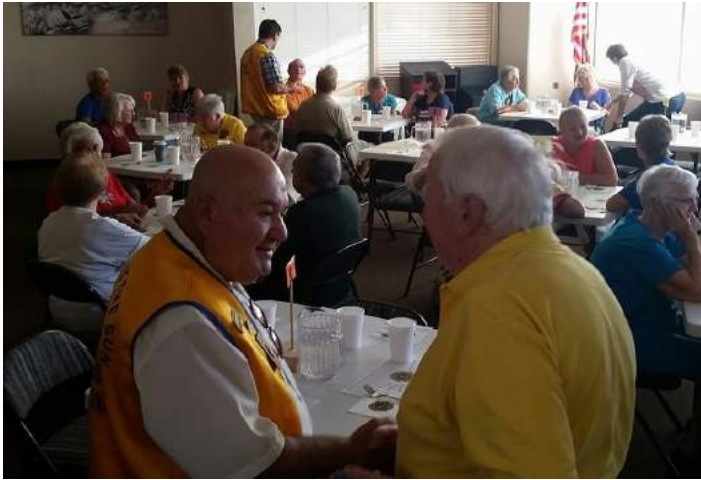
Mesa FOS hosted a pizza party to thank their non-Lions volunteer. Way to Go!!