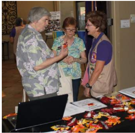
Catalina Oro-Valley LC hosted an information booth and Vision Screening Demonstration for Saddlebrooke residents.