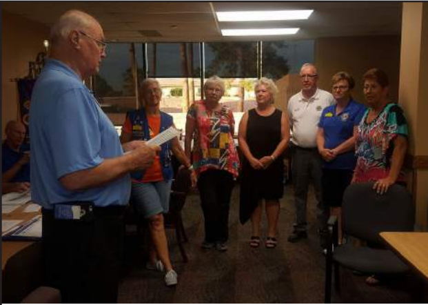
Chandler Sunbird inducted 3 new members.