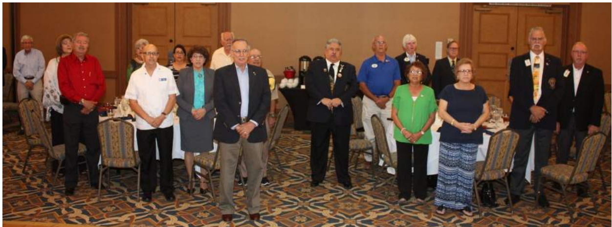
South Tucson Lions Club celebrated 70 years in Lionism in grand style. Congratulations!!