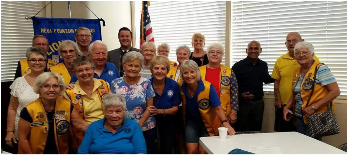
The Fountain of the Sun Lions Club gathering after an inspiring presentation by District Marketing Communication