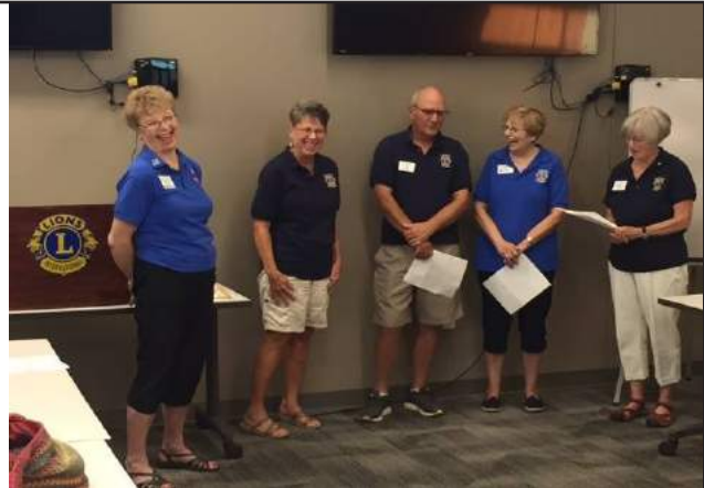
Maricopa Lions Club inducted a new member.