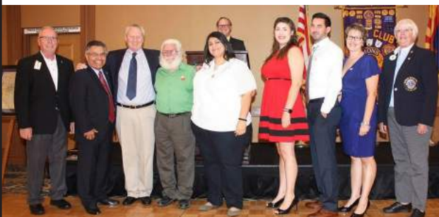
South Tucson LC recently formed a branch clubs with 8 members.