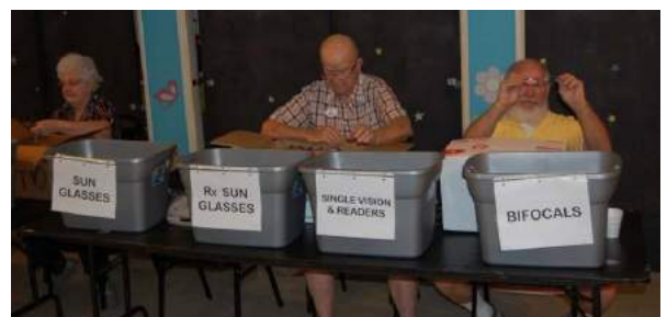
Tanque Verde Valley Lions sort eyeglasses for the Arizona Lions Eyeglass Recycling Terminal.