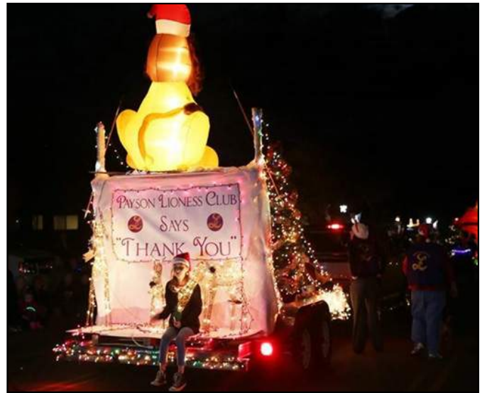
Sitting in back of float is future Lioness Sophia Cantlin, daughter of Lioness Christina Cantlin.