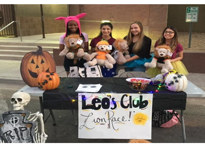
Hamilton High School Leo's Club played bingo with kids at the Downtown Chandler Spooktacular Festival and promoted volunteerism.