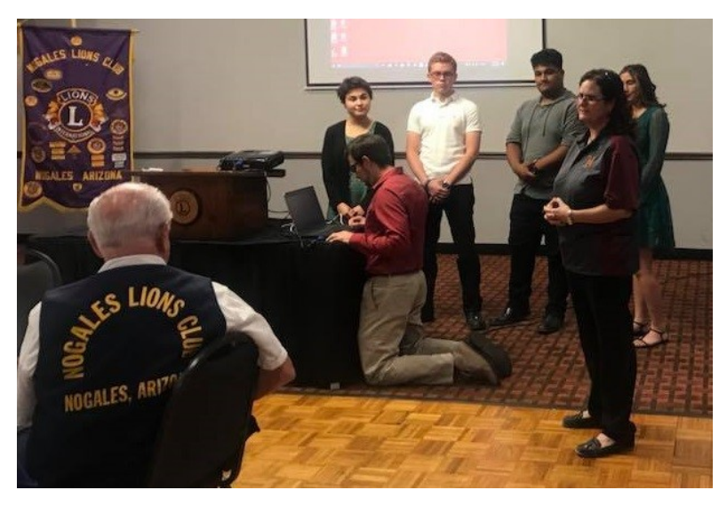
Nogales High School Leos Club were guests of their sponsor club; Nogales LC.