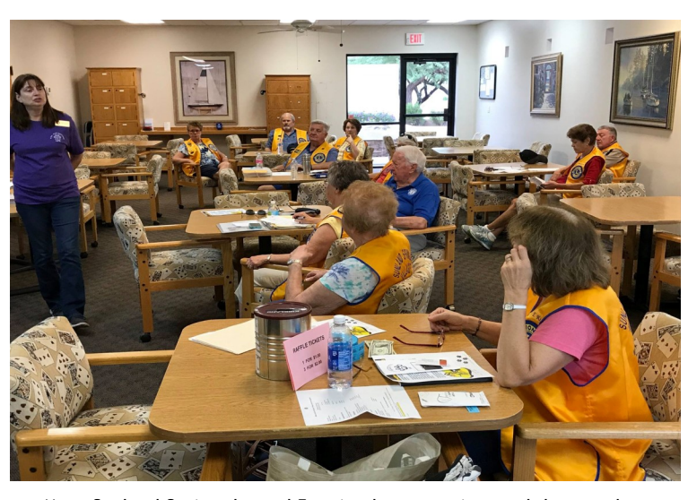
Mesa Sunland Springs hosted 5 trained pet, service, and therapy dogs from Paws 4 Life, located in Apache Junction.