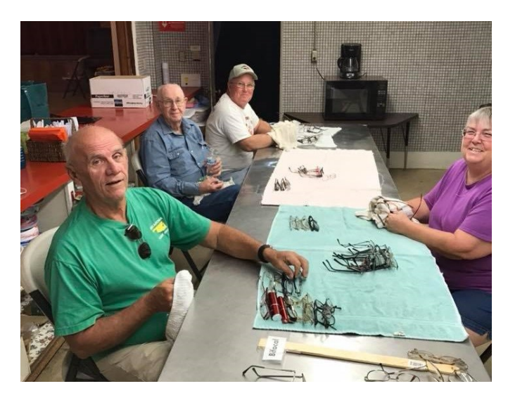
Globe Lions sort and clean eyeglasses for the Arizona Lions Eyeglass Recycling Terminal.