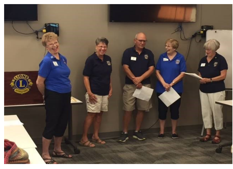
Maricopa Lions Club inducted a new member.