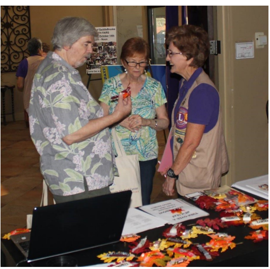
Catalina Oro-Valley LC hosted an information booth and Vision Screening Demonstration for Saddlebrooke residents.