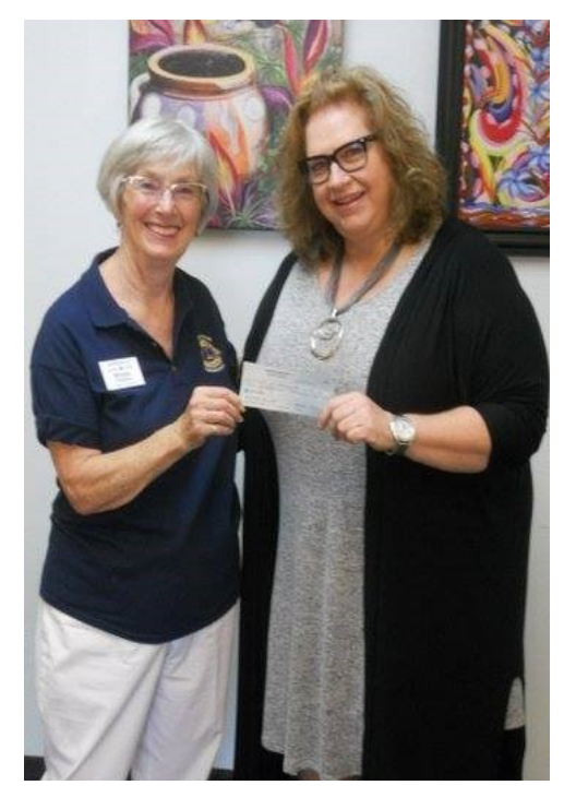
Maricopa Lions Club donated $500 to the Maricopa Food Bank. Kudos!!

Please download the logo from LCIs website <a href="https://www.lionsclubs.org">www.lionsclubs.org</a>