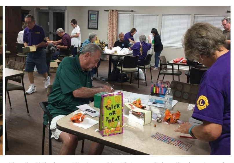
Chandler LC had a terrific time making Christmas gift bags for those in need.