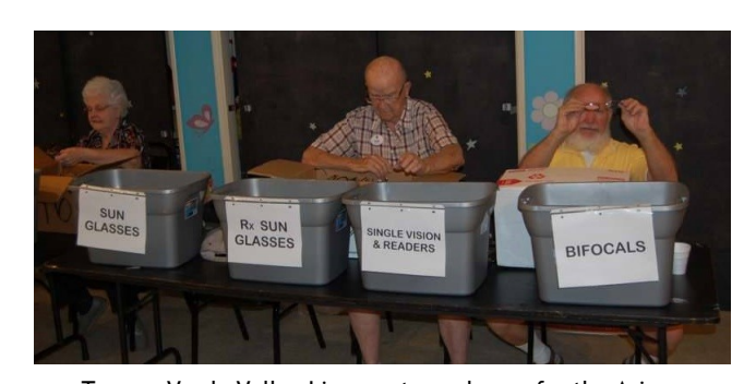
Tanque Verde Valley Lions sort eyeglasses for the Arizona Lions Eyeglass Recycling Terminal.