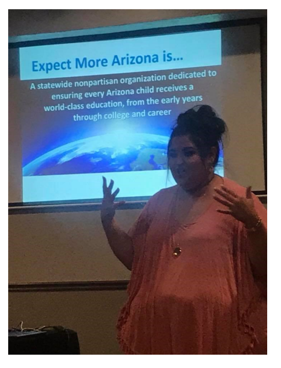
Expect More Arizona was guest of the Nogales LC.