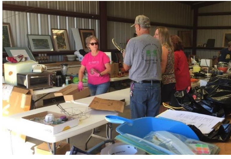
Cochise Stronghold Lions Club hosted a BIG BARN SALE in Pearce.