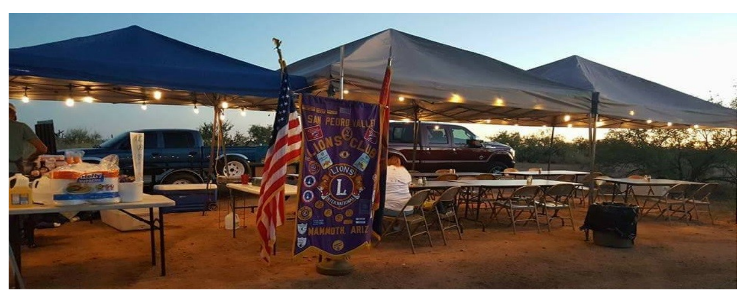
San Pedro Valley Lions Club from Mammoth, AZ hosted a breakfast for the early quail hunters.