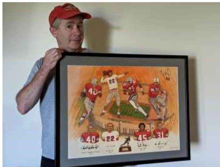
Signed Heisman print next to full scale PDG for size comparison