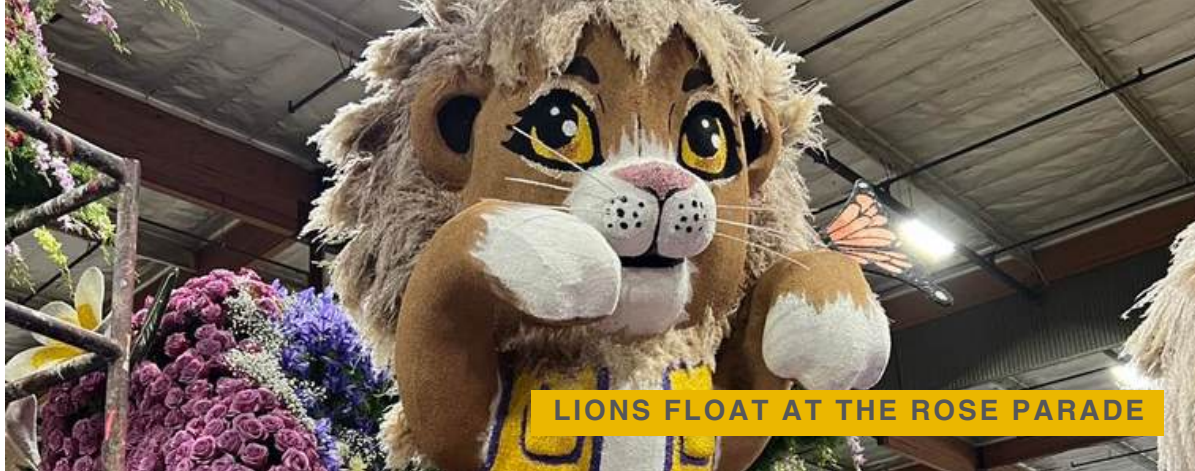
LIONS FLOAT AT THE ROSE PARADE