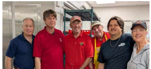
Our Kitchen Crew