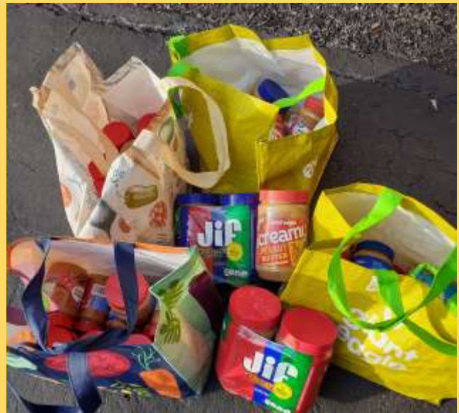
Peanut Butter Mountain begins!

Lions from throughout the state are being asked to bring in jars of peanut butter to be transported down to the State convention and, eventually, to the Buckeye Food Alliance. The OH5 Cabinet has already kicked off the campaign locally. At the cabinet meeting last week, each Lion present was asked to bring a jar of peanut butter. We already have more than 60 lbs of peanut butter to get us started. Let's see how much we can collect at the Zone and individual club levels over the next two months so that when the time comes, we can see our contributions added to those of Lions across the state, and feed a whole lot of hungry students.