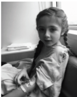
Sydney – February, 2019