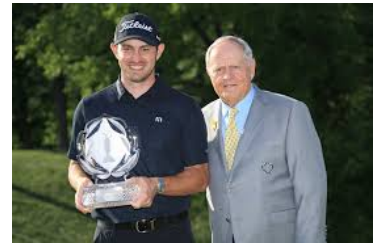
(Jack Nicklaus and Pat Cantlay, 2019)