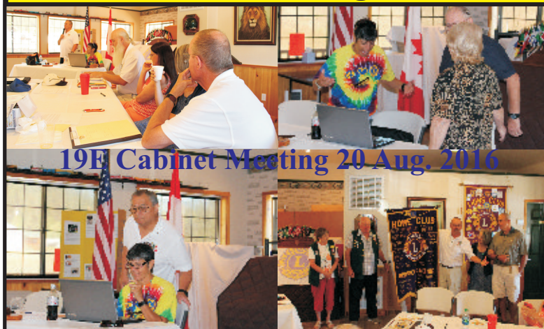
19E Cabinet Meeting 20 Aug. 2016

PLEASE SUBMIT ALL DG NEWSLETTER ARTICLES TO: district19e.dg.newsletter@gmail.com