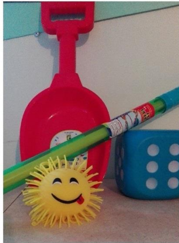
CLUBS AND BALLS SUPPLIED!