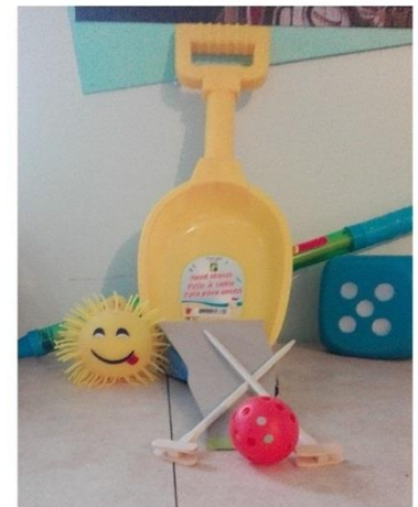
FUN FOR ALL AGES!

LIONS PARK BEAVER FALLS $10 per TEAM OF 4