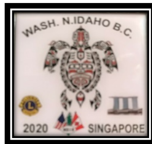
The Winning Pin!