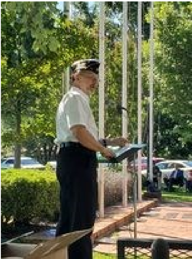
Attending the funeral of a soldier he had never met, but his belief is "Once you raise your hand, you are all brothers"