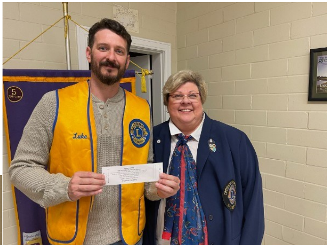
Above: The Gov purchasing a raffle ticket during her visit with the Leesville Lions.

One would think that covid restrictions would really reduce the work load of our governor, but in fact it had the opposite affect sometimes quadrupling the effort to get to club visits. But she says “worth it!” She loved visiting clubs that were meeting. Here are a few from this last quarter.