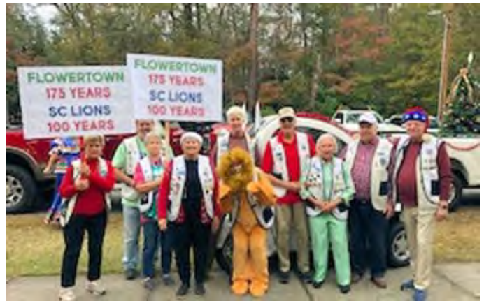
Summerville is Noon and Evening Lions ready for the Parade!