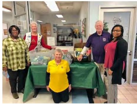
Supplies delivered to Dorchester Seniors!