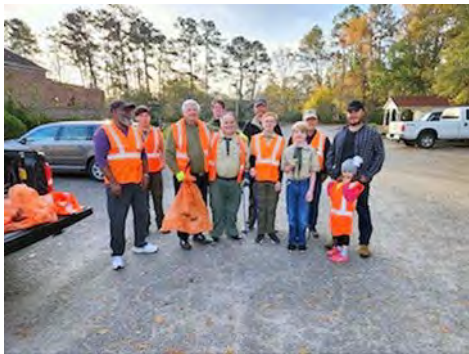
Adopt a Highway included Boy Scouts as our helpers!