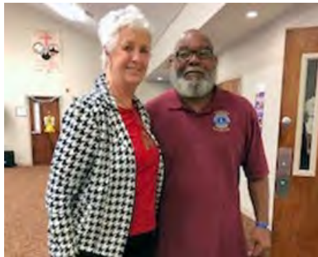
Lions Martha Sue and Marvin