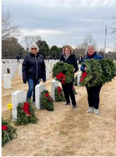
Lions participated in Wreaths Across America at Florence National Cemetery.