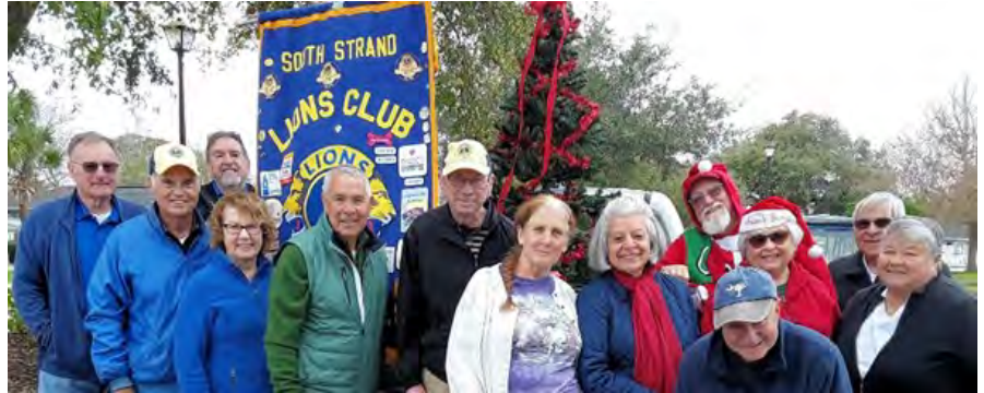
Lions enjoyed participating in the Surfside Beach parade.