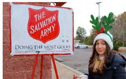
Lion Art Lader