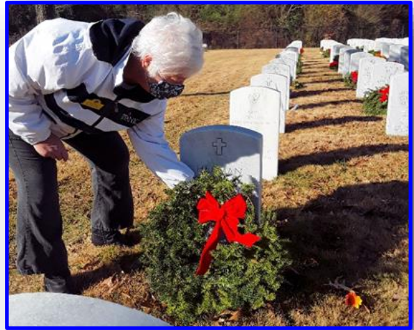
Lions laying wreaths on the veteran's graves at Florence National Cemetery.