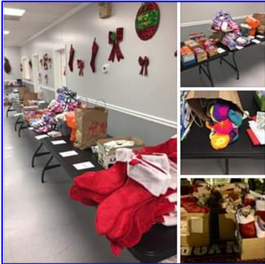
Club prepared 75 stockings for Garden City Nursing Home, filled with hygiene items, socks, snacks, toothbrushes/paste, Kleenex, and a hand crocheted coaster for each one (by a great neighbor in Oceanside Village).