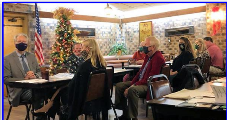
Guest and club members in attendance on the night.