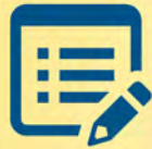
TABLE OF CONTENT