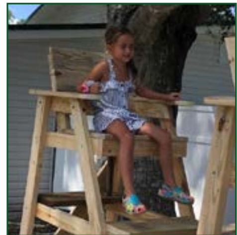
Lifeguard Chairs are rebuilt and tested by, maybe a future counselor?