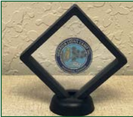
Challenge Coin Front

Again, any donation amount is appreciated but this time we have a CHALLENGE COIN that has the camp logo on the front and Keep the Camp Fires Burning on the back. For a donation of at least $100 you will receive the coin plus a 3D display to place the coin in, if desired.