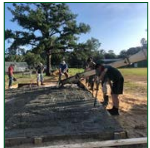
Concrete slab work for special activities building