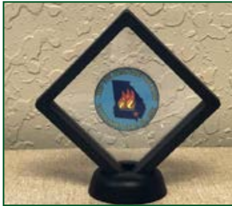
Challenge Coin Back