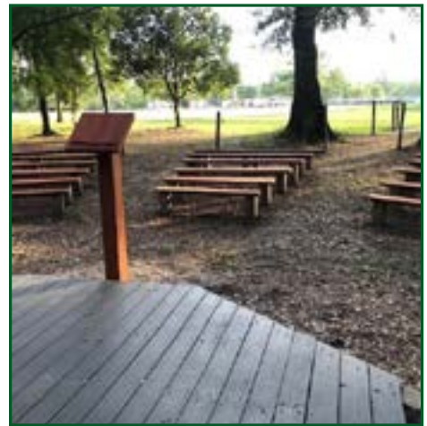
Outdoor Amphitheater gets a facelift