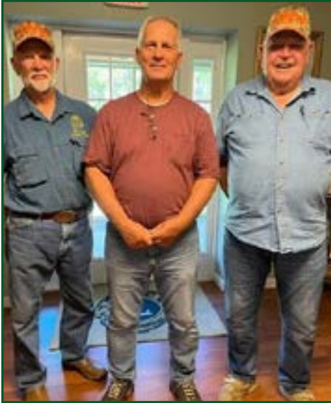
Ellijay Lions Members

Lion Robert and Lion Jim drove to the camp and delivered the tables. They then turned around and drove back to Ellijay the same day. Pictured are the 7 tables all stained and weather treated waiting to be spread around the camp. 5 are located at what we call the swing and fire pit area. Thanks to all the Ellijay Lions for their generous donation of these tables.