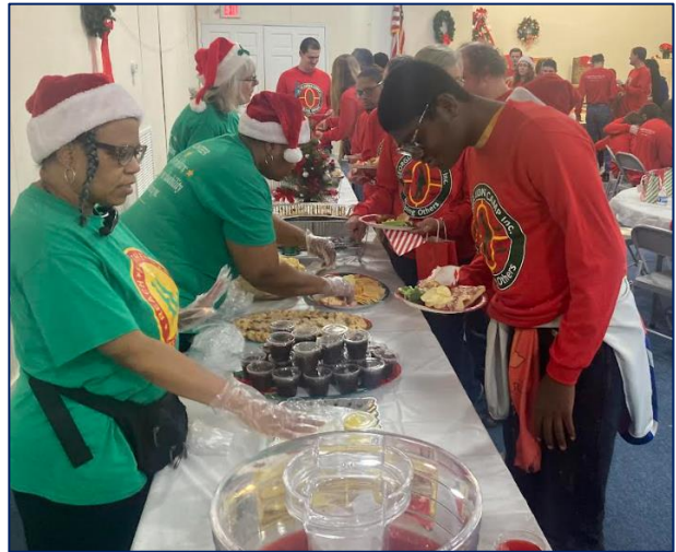
Georgia Lions Camp campers partake in an excellent Christmas feast.