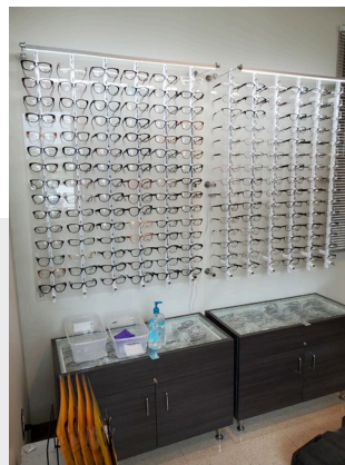
Photo 2: A wall display of women's frames, donated by our partner frame manufacturers, gives patients a wide selection to choose from (right).