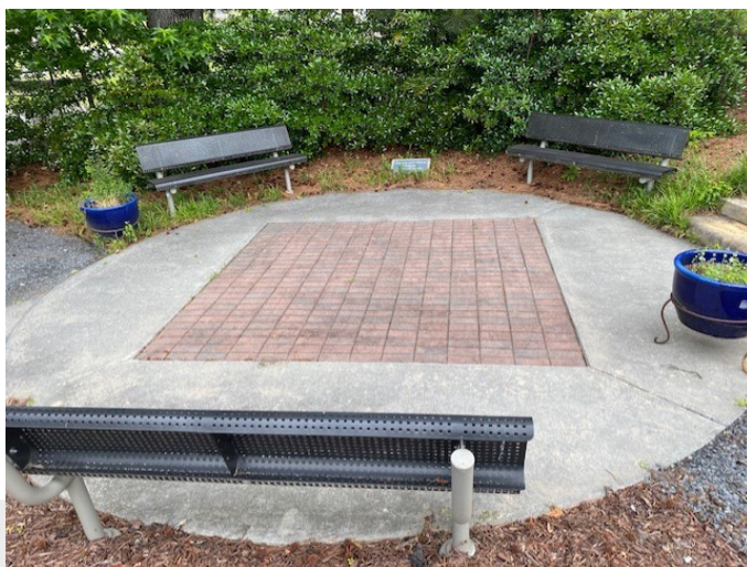
Photo 4: The Tom and Mildred Bingham Memorial Garden at GLLF’s Chamblee office. The inlaid brick and brick paths will be refreshed with engraved bricks honoring donors and loved ones.

“When a patient is able to truly see their loved ones for the first time, it is a beautiful moment.”