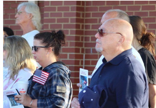
WNL PROVIDING & HANDING OUT FLAGS & PROGRAMS AS WE HAVE FOR 20 YEARS.