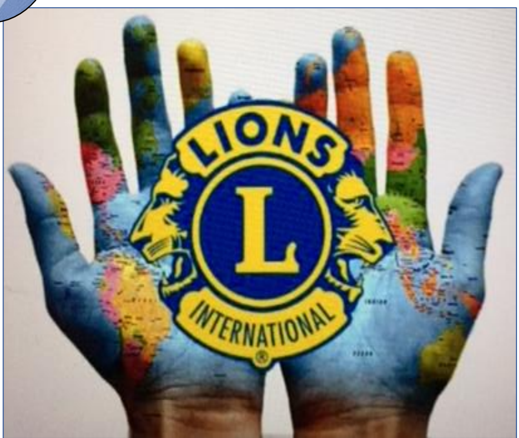
"Serve locally, give globally"