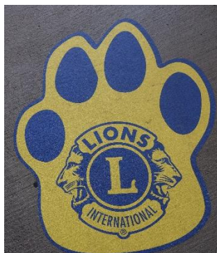
Paw prints on path to show way to convention sessions