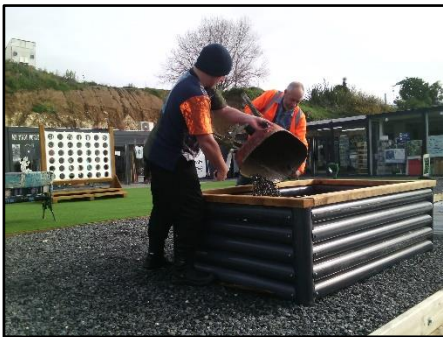
Both Kaikoura Lions Clubs have prepared these planter boxes ready for planting with a colourful mix in the Hub.