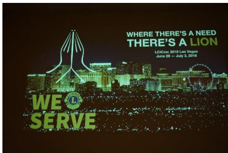
Neon signage for Convention