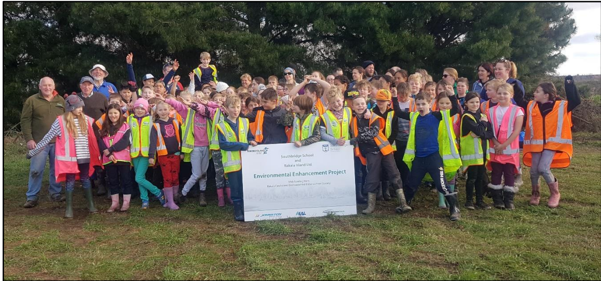
Southbridge School planting day at Rakaia Island successful, Lions contributed 70 hours.