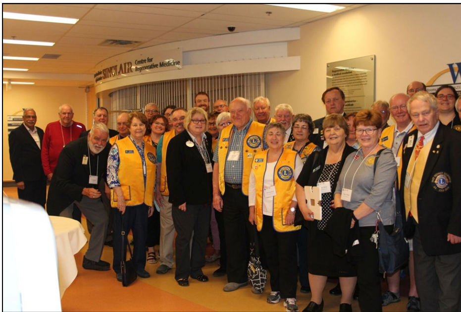
Lions Day at the Eye Institute

Thank you to the many Lions who supported this project.