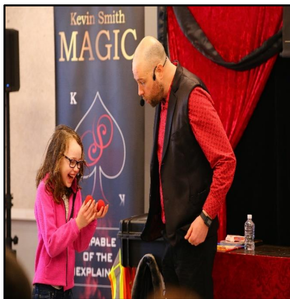
A magician wows a young guest