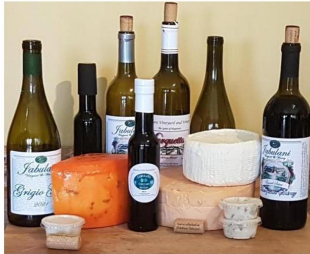
Virtual Wine Tasting Fundraiser for Lions Dog Guides