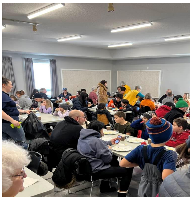
People enjoy the meal WE SERVE