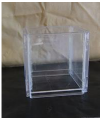
4 CD cases glued into a cube.

My Recycle, Renew, Reuse feature this month is: My friend was moving so he brought me a box of empty CD cases to recycle. I took them apart and built a jig to hold them while I used my glue gun to make a cube. These work well as a center piece with photos, cards, cartoons, poems, prayers etc. I was able to make 17 for use at Easter Seal Camp Winfield.