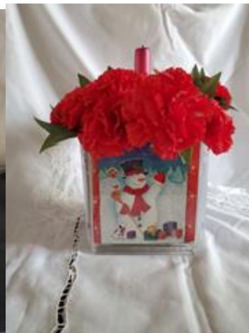
Christmas Cards inserted!!