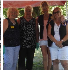
Senior Picnic volunteers