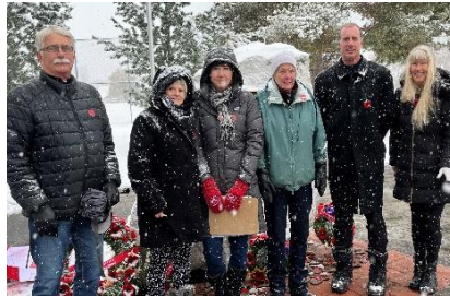
Lions at Remembrance day