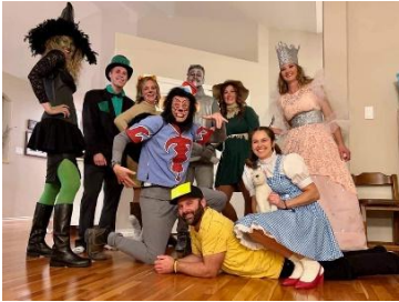
Best costumes at Halloween dance

Lavington Schools. We also hosted a community Halloween Party and participated in the Remembrance Day Ceremony. As we head into December holidays, the Lumby Lions will "ring the bells" for the Salvation Army Kettle Campaign and continue to provide support to children, seniors and individuals requiring financial support.