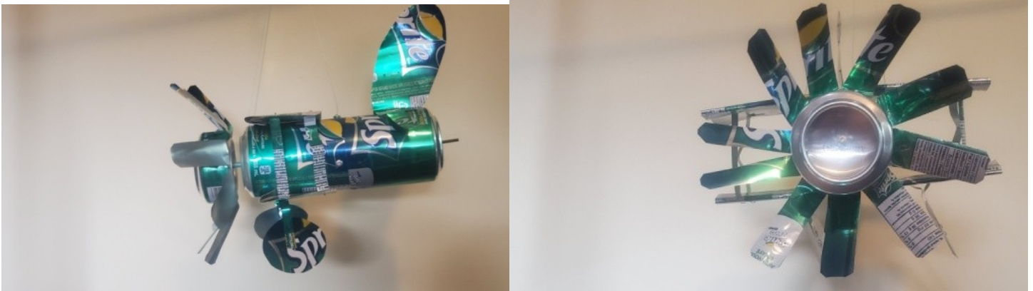
Plane made from a pop can