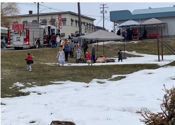
Outdoor activities area