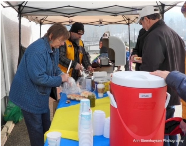
Serving up hot dogs