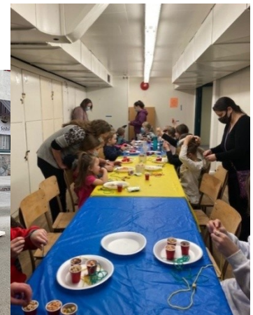
making licorice jewelry