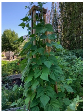
Bean Pole made from scrap wood

PZC Angus Environment Chair environmentangus@gmail.com