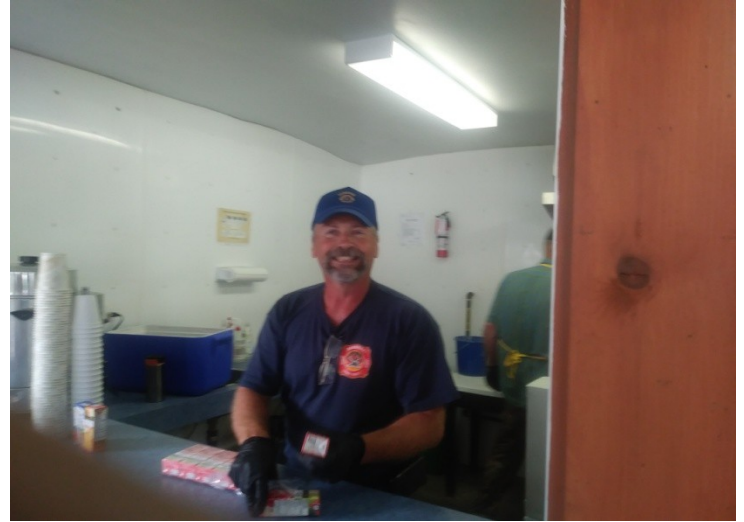
Barriere Lions hard at work with the Pancake Breakfast at the North Thompson Fall Fair