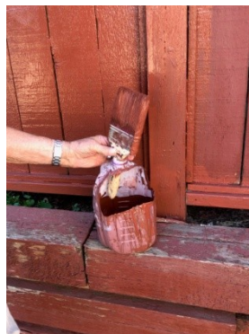
milk jug paint 'can'