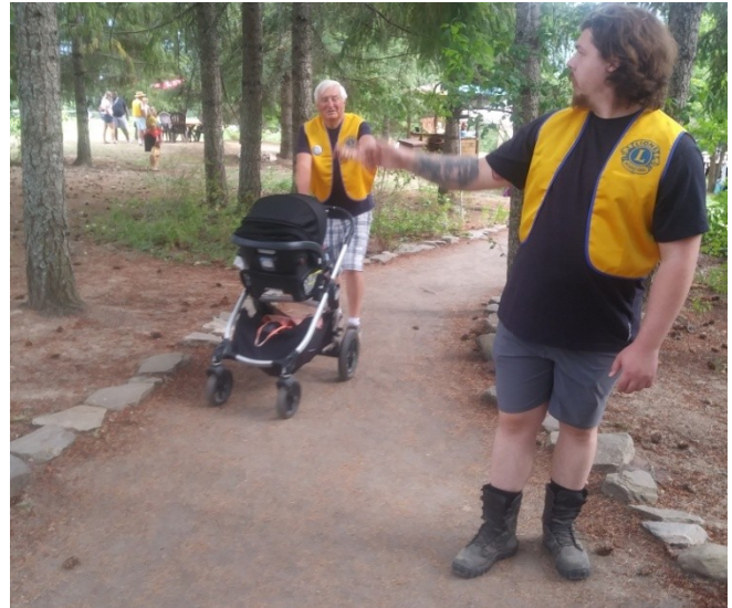
North Shuswap Lions Club at the 3 rd Annual Fine Wine String Quartet at Celistia Estate Winery