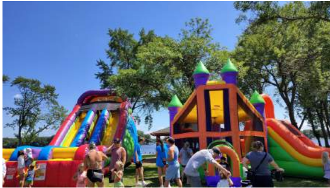
Inflatables sponsored by our club at Elk River Fest