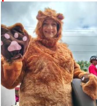
Elk River LION in the parade!