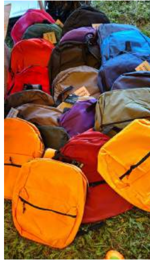
Elk River Lions donate back packs for the kids