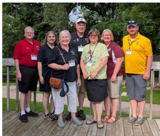
5M7 Lions volunteering at Opening day of Camp Sweet Life.