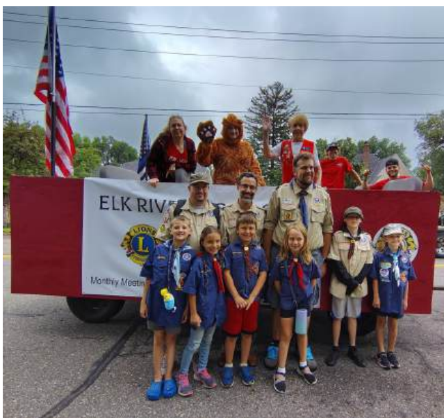
Cub Scout Troop # 111 helped us hand out candy at the parade