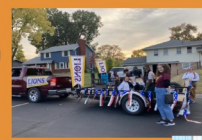
CR Lion Pancake Breakfast