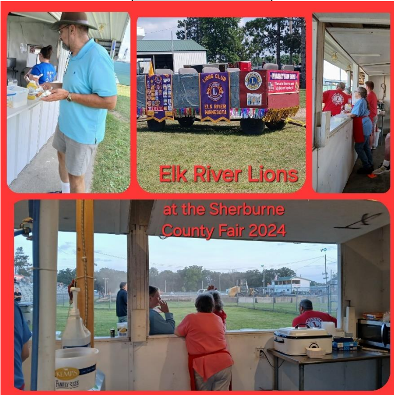
The Elk River Lions Club served food and root beer floats, and gave away $3500 worth of backpacks and school supplies at the Sherburne County Fair.