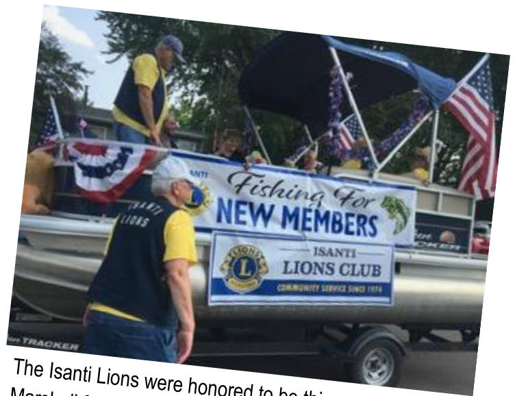
The Isanti Lions were honored to be this years Grand Marshall for the Isanti days parade. Isanti lions have generously served the Isanti Community for 50 years of service.