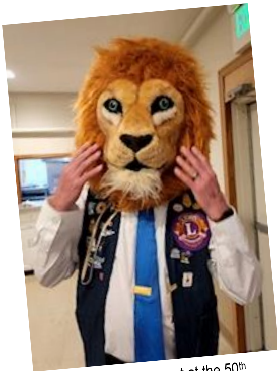
The Isanti Lions mascot at the 50 th Anniversary.