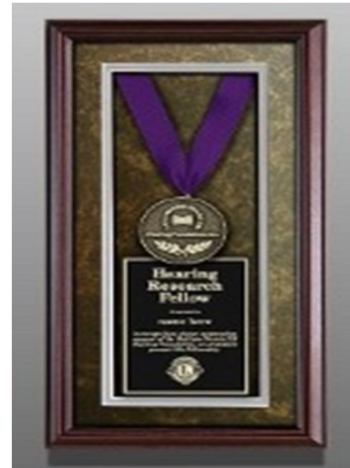
Minnesota Lions Hearing Foundation Award

The plaque is a lovely tribute for service to others, especially in the field of hearing health. Over the next few months, we will be describing several of the research grants that have been given out this year. We are sure you will find some of them interesting and informative.