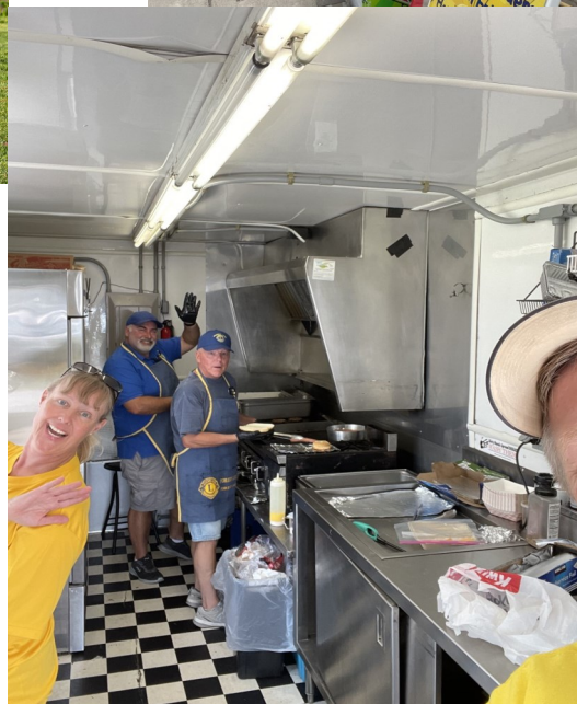
Forest Lake Food Truck and the COOKS!!