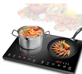
Double Induction Cooktop Portable Countertop