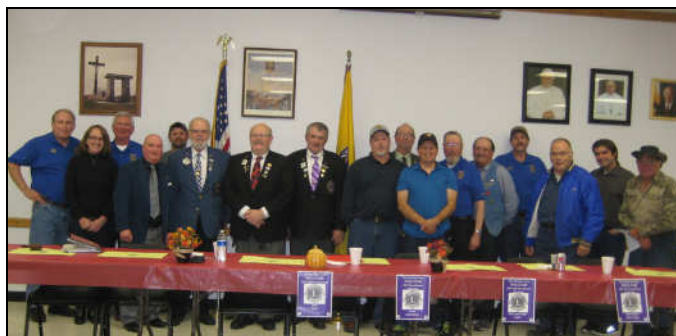
Group picture of Governors Night attendees.