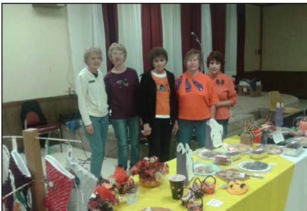
The Coon Rapids Lioness sold their goodies at their bake sale and craft tables.