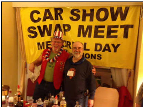
Elk River's hospitality room.