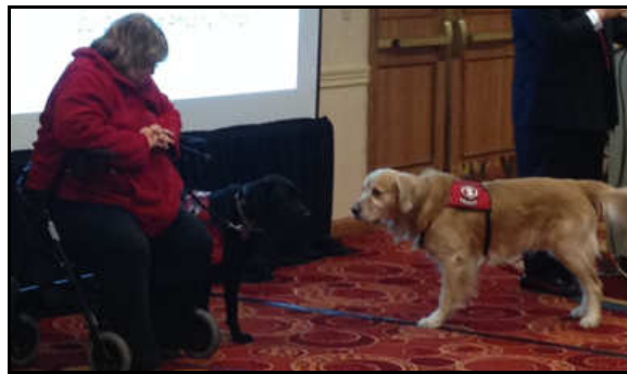
Can Do Canine's seminar