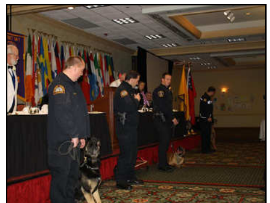
St Paul Police Canine Unit demonstration