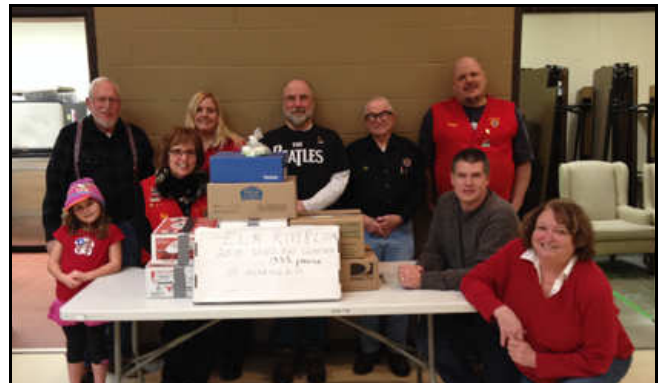
Elk River eye glasses collection.