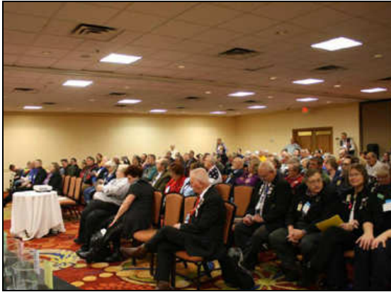
Saturday's Business meeting