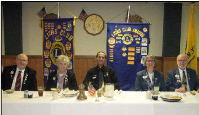
The "suits" have arrived!