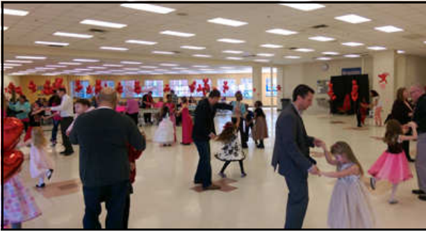
More Sweetheart photos...