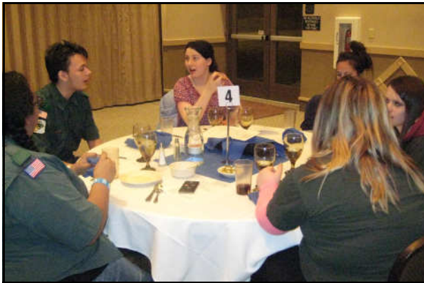
Venture scouts were honored for all they do to help the Wyoming Lions with a plaque, a huge pizza and bowling.