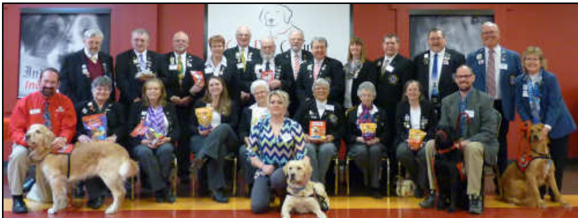
Lion District Governors Elect visited Can Do Canines facility on March 11, 2015 to see first-hand how Can Do Canines assistance dogs change lives.