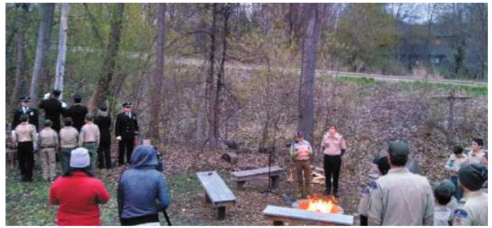
The Circle Pines Lexington Lions, along with the Centennial Fire District Honor Guard and Boy Scout troop 65 did a flag retirement to lay to rest 40 American flags. The flags were lay to rest with words to say "You have served your country well, now rest in peace."