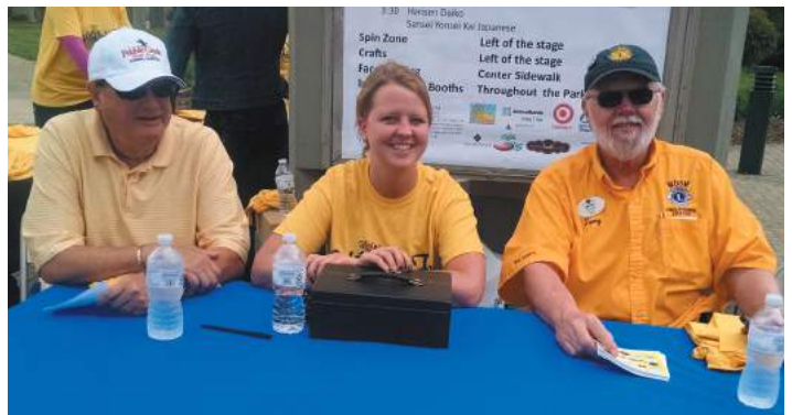
Blaine Central Lions volunteer at Blaine World Fest.