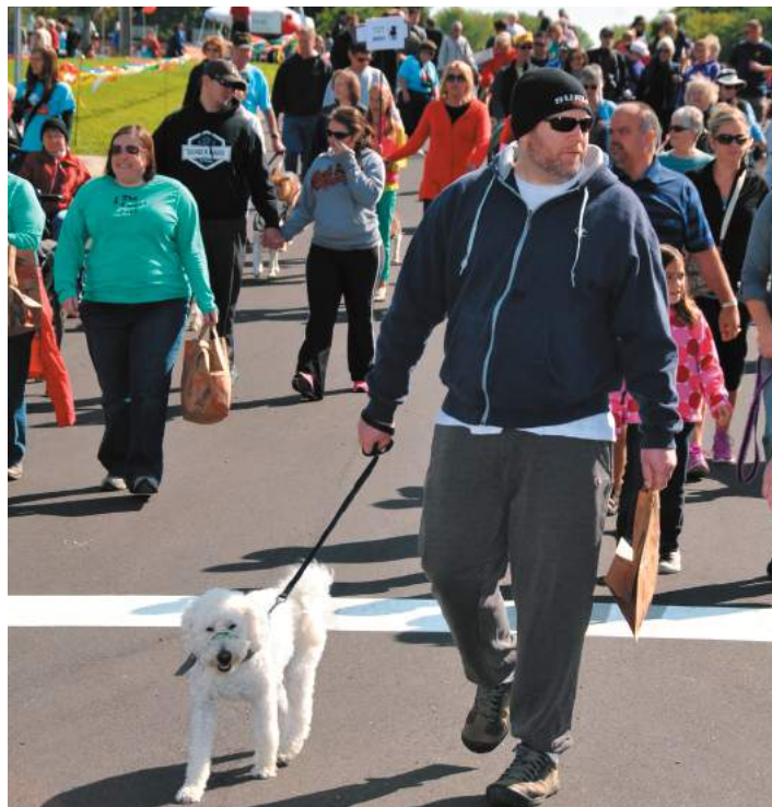
More than 200 walkers, 100 dogs and 90 volunteers participated in the Can Do Canines walk in 2014 to raise money to train assistance dogs for people with disabilities.

And, save the date for our Fall Graduation Ceremony taking place on October 24!