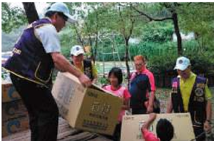
The Lions Clubs International Foundation has responded to Typhoon Soudelor, that has affected millions.

Chairperson, Lions Clubs International Foundation