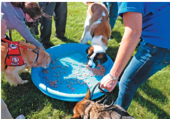
A group of dogs take a break from the Woofaroo to go "Bobbing for Hot Dogs."