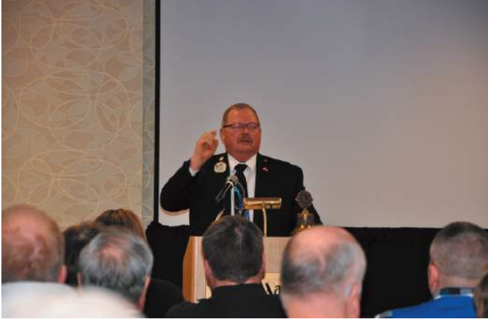
The business meeting took place Saturday afternoon.