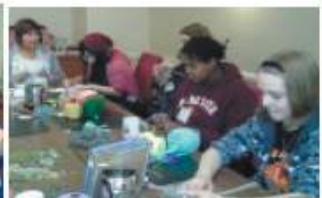
Leos working on a variety of projects.