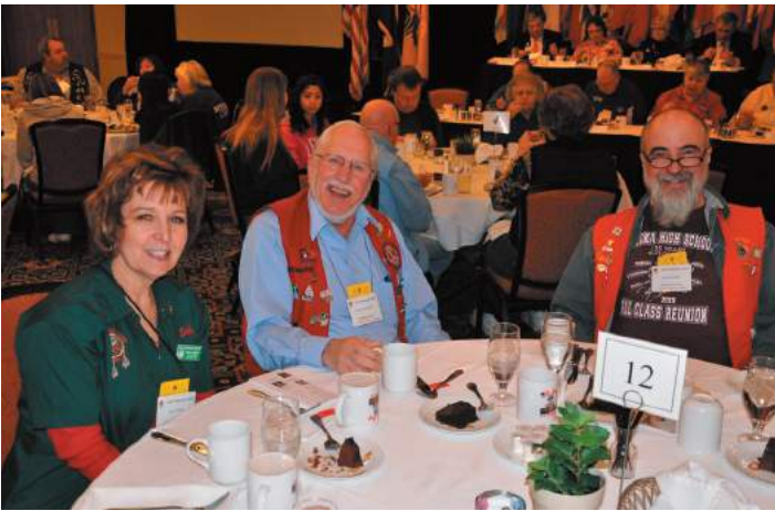
Elk River Lions at the luncheon