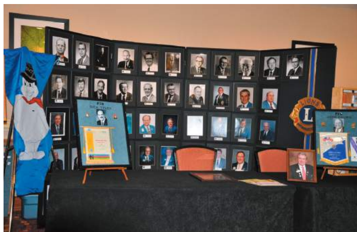
A display honored the 5M-7 Past District Governors.