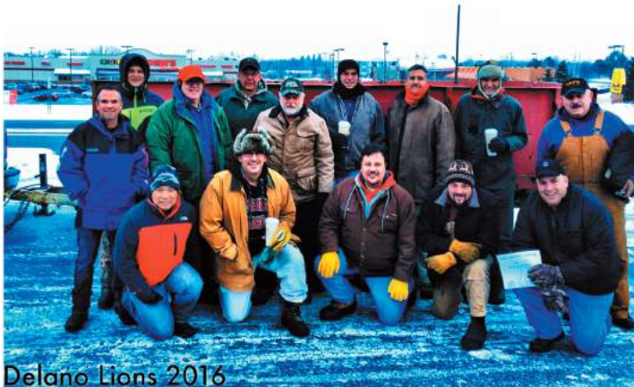
Delano Lions 2016

The Delano Lions collected Christmas trees and nearly 500 pounds of food donations Jan. 9.