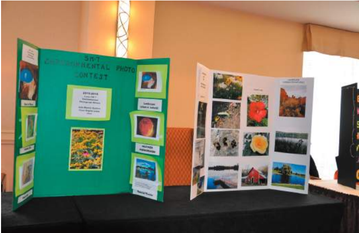
The Environmental Photo Contest was on display.