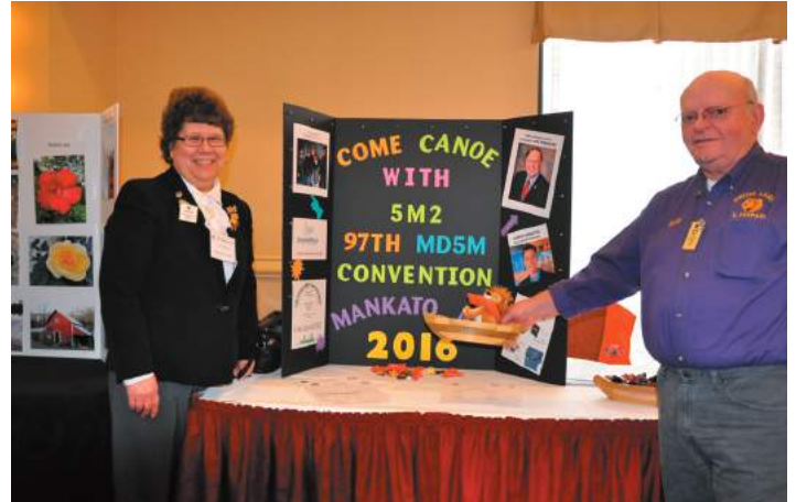
Organizers promoted the MD5M Convention.