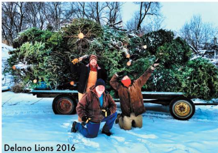
Delano Lions 2016

The Delano Lions collected Christmas trees and nearly 500 pounds of food donations Jan. 9.