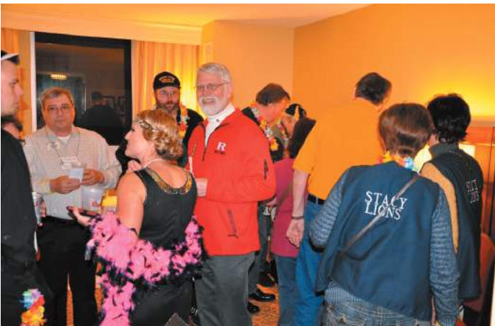
One of the hospitality rooms