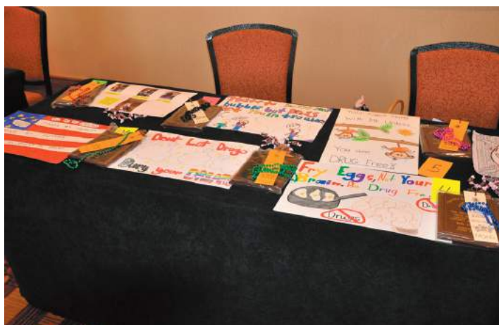
Young people made anti-drug posters to be displayed.