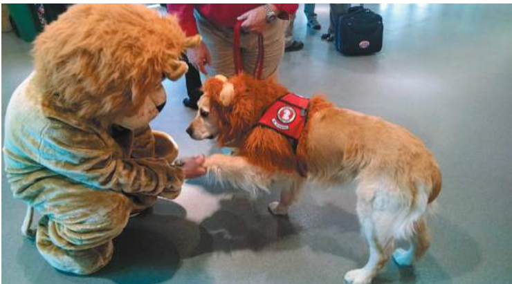
Can Do Canines demonstration dog Sam makes a friend at the MD5M Multiple Convention in Mankato.