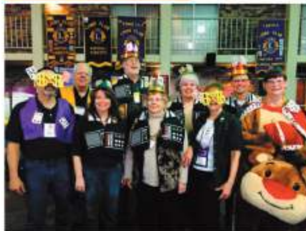
Districts 5M9 and 5M3 held a Poker Walk at their Midwinter Conventions to raise money for diabetes research and education.