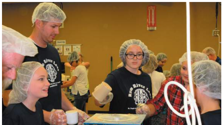
Rum River Leos and their advisor