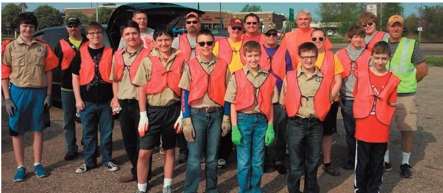
Albertville Lions Club hosted a highway pickup May 7, with help from the Albertville Boy Scouts pack 547 and St. Michael-Albertville High School students. The crew included six Albertville Lions, three STMA High School students, and 10 members of Albertville Boy Scouts Pack 547.