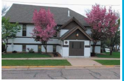
All proceeds go back to our local community