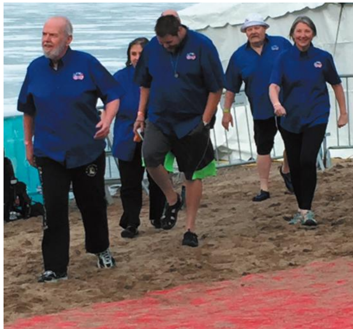
A few brave (?) Lions from 5M7 doing the Polar Plunge.