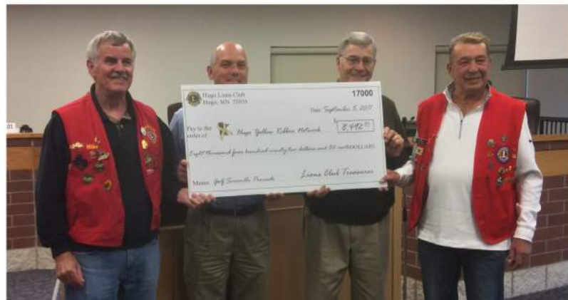
The Hugo Lions donated $8,492.80 from their Golf Scramble to the Beyond the Yellow Ribbon Network.