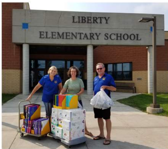
The Big Lake Lions donated $425 worth of school supplies to the Liberty Elementary School in Big Lake.